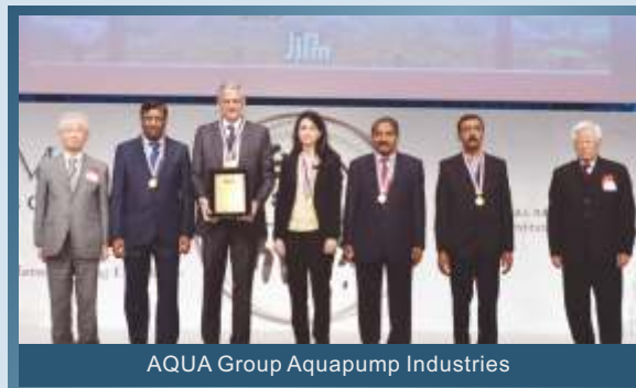
AQUA Group Aquapump Industries