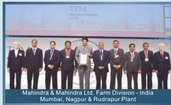
Mahindra & Mahindra Ltd. Farm Division - India Mumbai, Nagpur & Rudrapur Plant