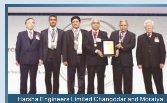
Harsha Engineers Limited Changodar and Moraiya