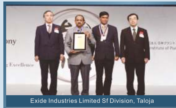
Exide Industries Limited Sf Division, Taloja