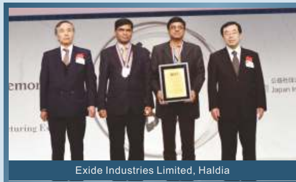
Exide Industries Limited, Haldia