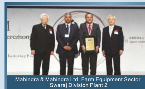
Mahindra & Mahindra Ltd. Farm Equipment Sector, Swaraj Division Plant 2