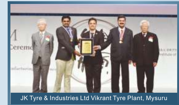
JK Tyre & Industries Ltd Vikrant Tyre Plant, Mysuru