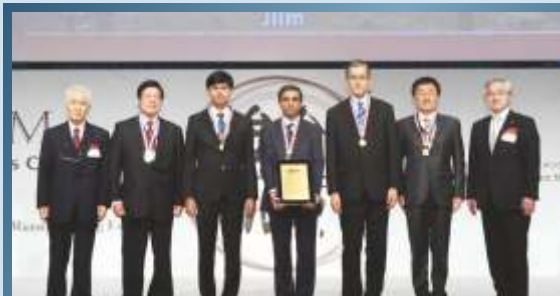
Toyota Kirloskar Auto Parts Pvt Ltd.