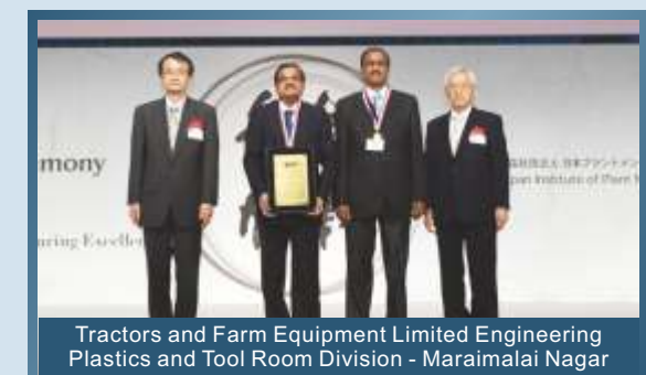
Tractors and Farm Equipment Limited Engineering Plastics and Tool Room Division - Maraimalai Nagar