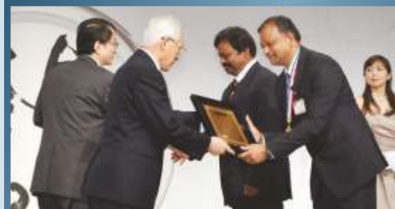
Tractors and Farm Equipment Limited Madurai