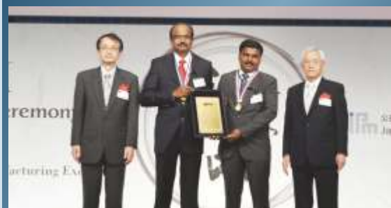
Tractors and Farm Equipment Limited, Dodballapur