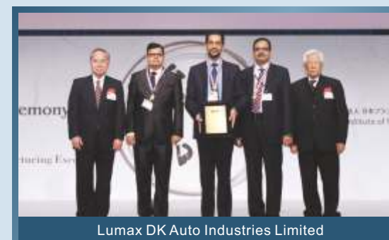
Lumax DK Auto Industries Limited