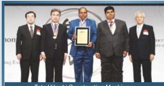
Tata Hitachi Construction Machinery Company Pvt. Ltd Kharagpur