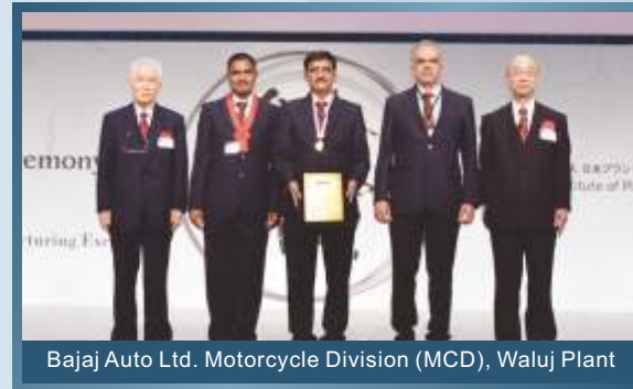
Bajaj Auto Ltd. Motorcycle Division (MCD), Waluj Plant