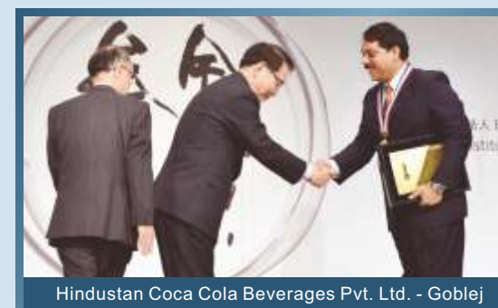
Hindustan Coca Cola Beverages Pvt. Ltd. - Goblej