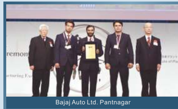
Bajaj Auto Ltd. Pantnagar