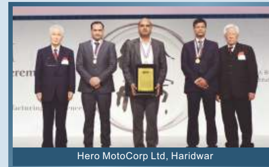
Hero MotoCorp Ltd, Haridwar