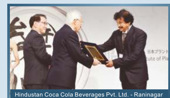
Hindustan Coca Cola Beverages Pvt. Ltd. - Raninagar