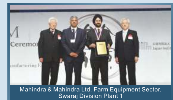
Mahindra & Mahindra Ltd. Farm Equipment Sector, Swaraj Division Plant 1