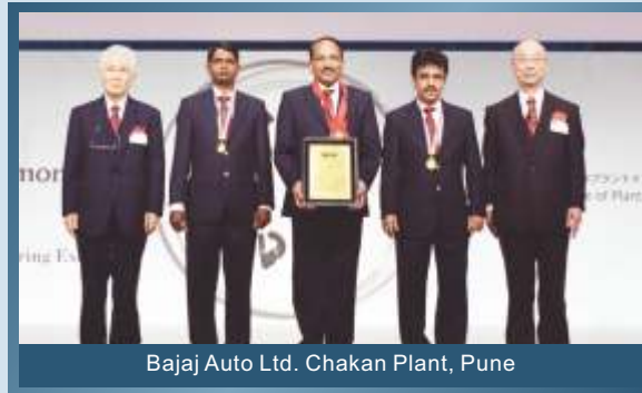
Bajaj Auto Ltd. Chakan Plant, Pune